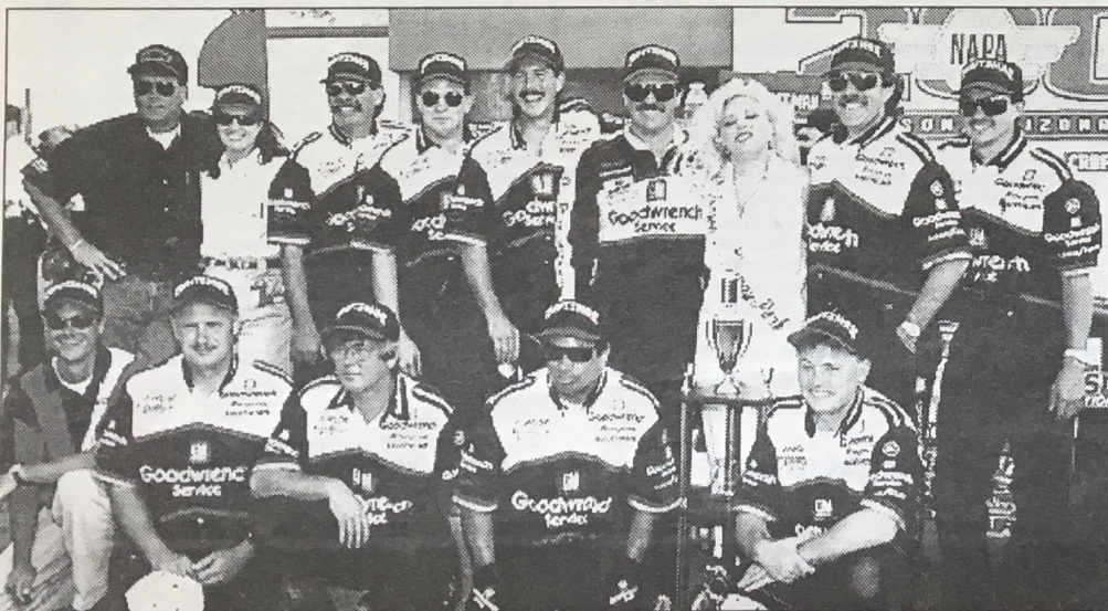
Mike Skinner and his crew enjoy victory lane at Tucson Raceway Park after winning the NASCAR Craftsman Truck race May 25.

City Championship Points (top 10 after seven rounds): 1. San Diego, 1208; 2. Las Vegas, 1070; 3. Woodland, 908; 4. San Jose, 847; 5. Santa Barbara, 808; 6. Reno, 572; 7. Portland, 461; 8. Wilsonville, 421; 9. Vancouver, 402; 10. Fresno, 323.